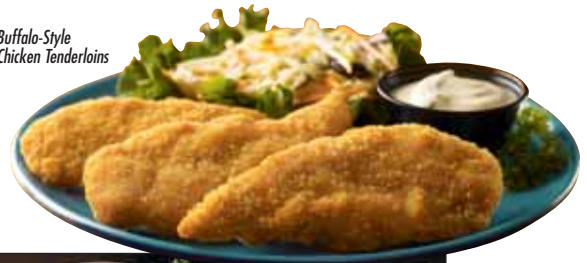
Buffalo-Style Chicken Tenderloins

In short, the Tenderloin Story is really a love story that starts with great tasting chicken, and ends with happy patrons!