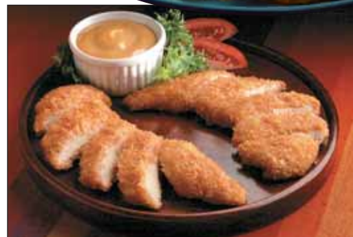
From appetizers to entrees, SQUAWKERS® Tenderloins are a hero.